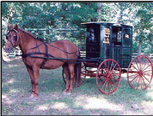
(The way the mail used to be delivered)

Discontinued, papers to Dunn , 12-2-1903