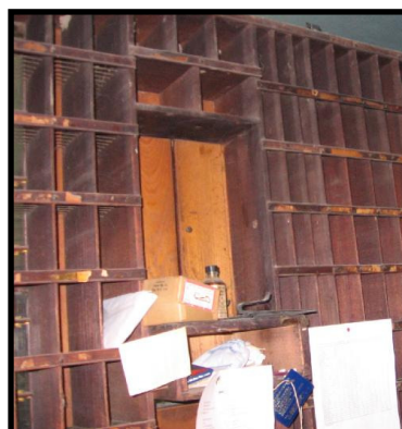
Mail slots in Averasboro Post Office were probably similar to above picture.