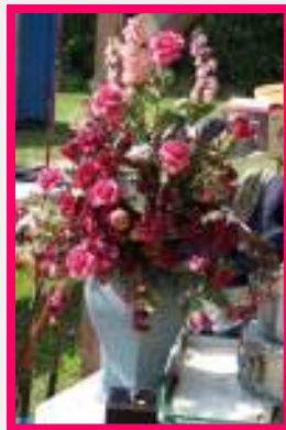
YARD-SALES ARE SPECIAL BOTH THE BEAUTY & THE BARGAINS