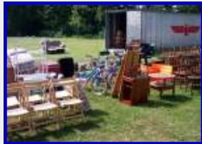
A FEW OF THE MANY ITEMS