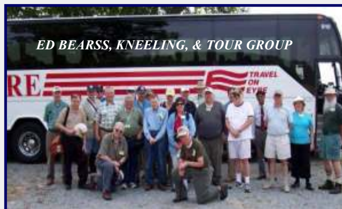
ED BEARSS, KNEELING, & TOUR GROUP

Noted author and historian, Ed Bearss recently brought a Smithsonian tour group to visit the Averagesboro Battlefield and surrounding area. Bearss, the former historian for the National Parks System has visited Averagesboro before and remarked that great improvements had been made to the museum since his last visit.